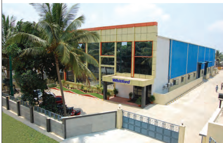
Whitford India, Bangalore