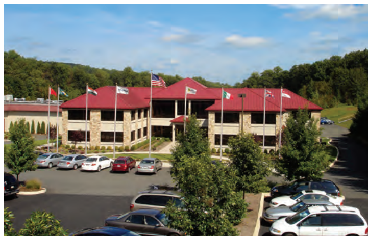
Whitford United States, Pennsylvania

Whitford now has 11 manufacturing facilities in 8 major markets, with Whitford sales offices in an additional 11 countries. We also have sales agents in 25 more countries. Together, we have more than 500 employees worldwide speaking some 30 different languages and dialects.