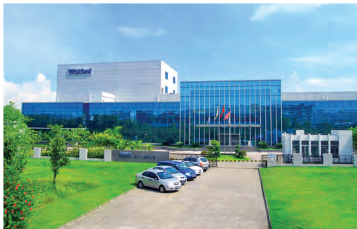
Whitford China, Jiangmen City