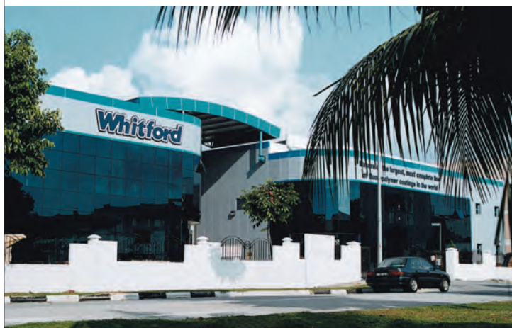
Whitford Singapore, Tuas Basin Close