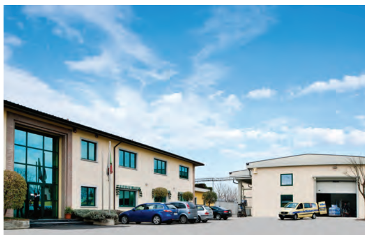
Whitford Italy, Brescia