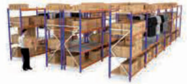
AR LS (LONGSPAN)