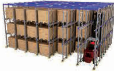
AR DRIVE IN